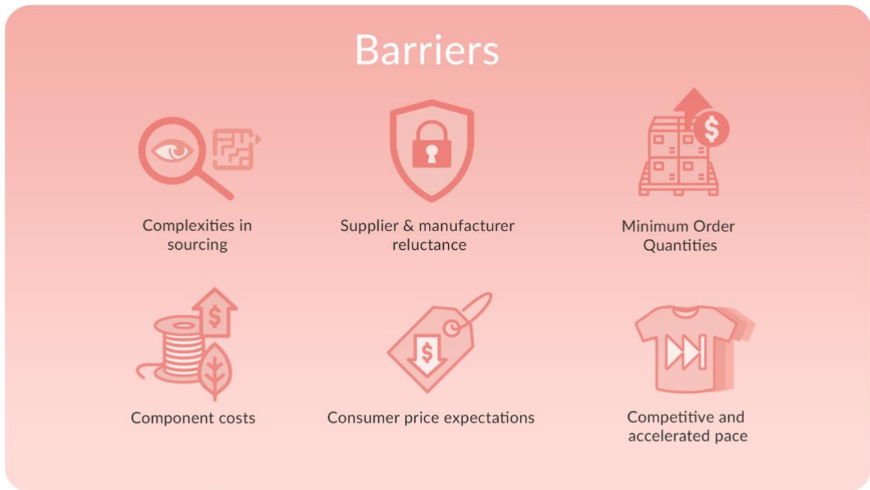
Figure 2. Barriers to Circularity

Icons representing the barriers (theme 4) are illustrated in Figure 2 and form a red ring on the Circularity Model. Jia, et al. (2020) noted similar challenges in their literature review focused on CE in the textile and apparel sector; and this study advances an Australian context of a consumer highly engaged in fast fashion culture (Miller, 2019; S2.6), a fragmented textile and manufacturing industry (Payne and Ferrero-Regis, 2019; S1.2; S1.3), and geographical isolation (Fleischmann, 2019; S1.2; S1.3).