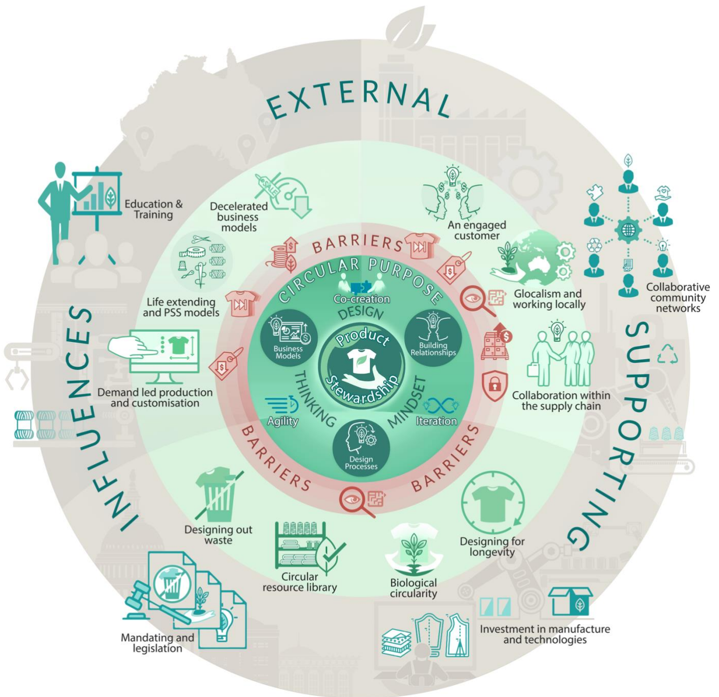
Figure 1. Circularity model: Australian fashion SMEs

The interactive relationships of the key themes above have been visualized in Figure 1. Visualisation of information enables quick insight and understanding of connections and relationships (Lankow, Ritchie, and Crooks, 2012). Frameworks and diagrams depicting circular design and production practices in the fashion sector have been used in literature to effectively depict interrelated factors at play (Islam, 2021; Jia, et.al. , 2020). Figure 1 advances these examples by introducing further themes that emerged from the research - underpinning design thinking behaviours, the role of new business models guided by circular purpose, and external supporting influences that may support circularity for Australian SMEs.